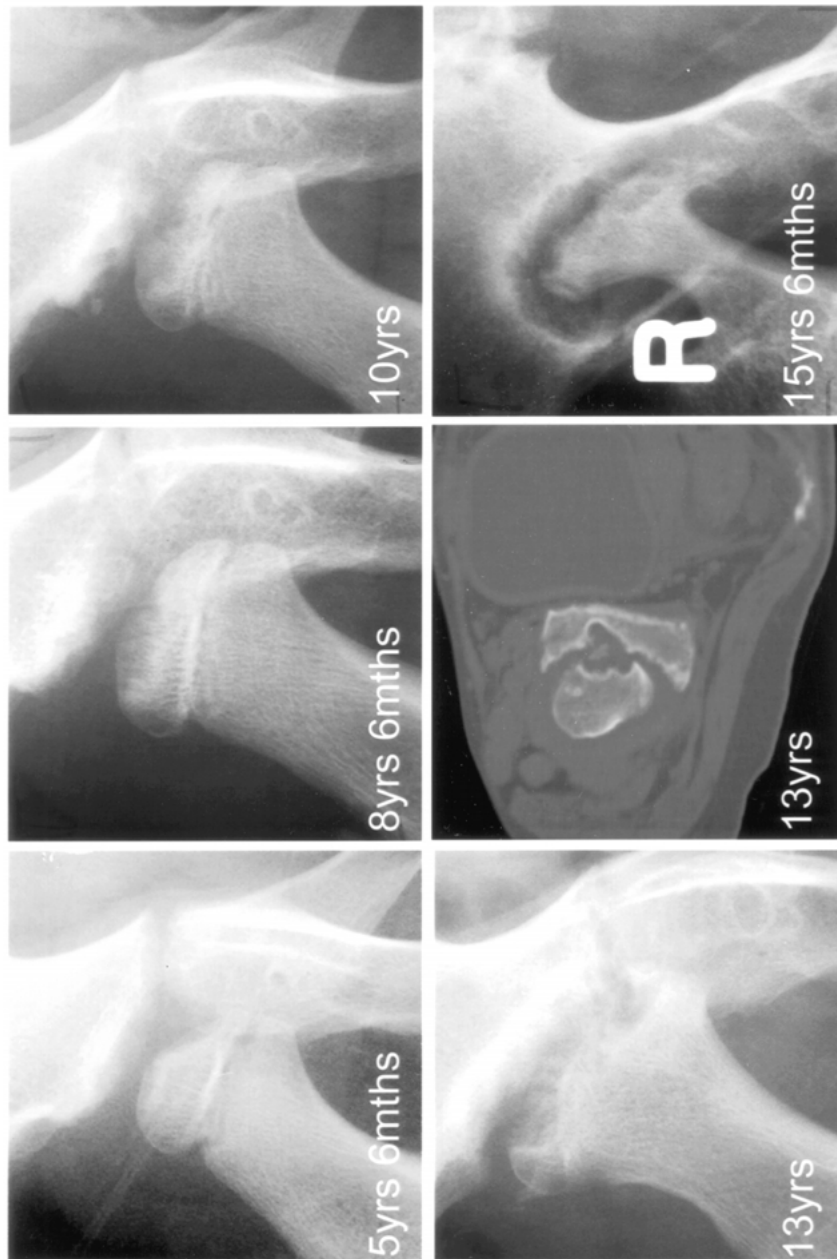
Figure 1 Radiographs of the right hip of subject B taken at ages 5½, 8½, 10, 13 and 15½ years, showing progressive erosion of the femoral head and the acetabulum. The final image, obtained after one year's pamidronate therapy, shows increased radiographic density but persistence of the erosive changes. The CT picture taken at age 13 years shows active bone destruction both of the femoral head and the acetabulum. The appearances were similar in subject A