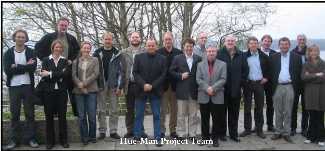
Hue-Man Project Team